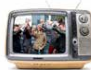
Gigolos 6th Season, March 17, Showtime