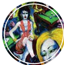
TINY PIECES OF SKULL, OR A LESSON IN MANNERS BY ROZ KAVENY