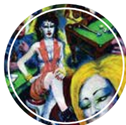
TINY PIECES OF SKULL, OR A LESSON IN MANNERS BY ROZ KAVENY