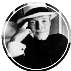
THE EARLY STORIES OF TRUMAN CAPOTE BY TRUMAN CAPOTE