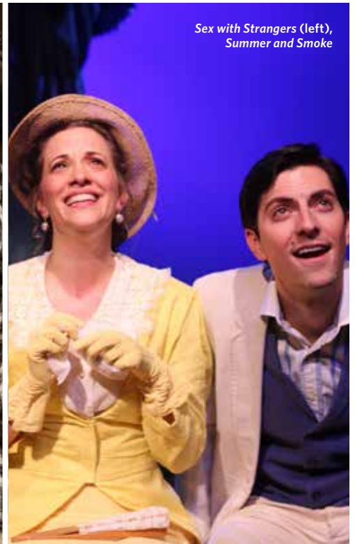
Sex with Strangers (left), Summer and Smoke