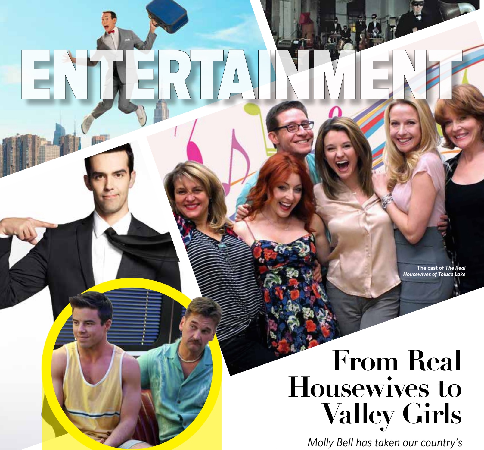
The cast of The Real Housewives of Toluca Lake